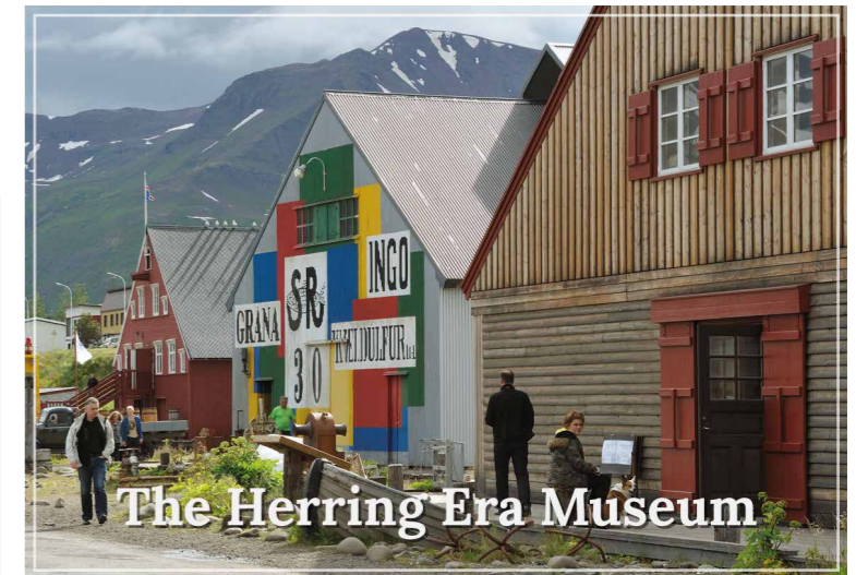
The Herring Era Museum